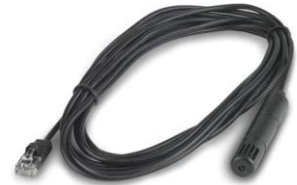
AP9335th Temp & Humidity probe for PS9631